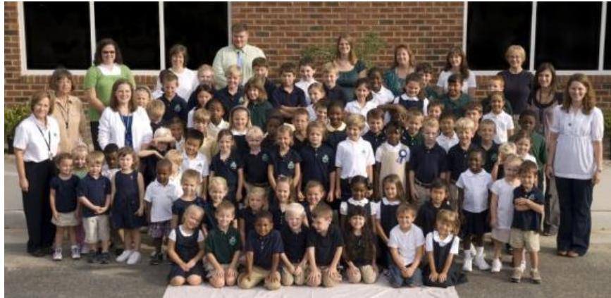
Students and Teachers at Calvary Classical School